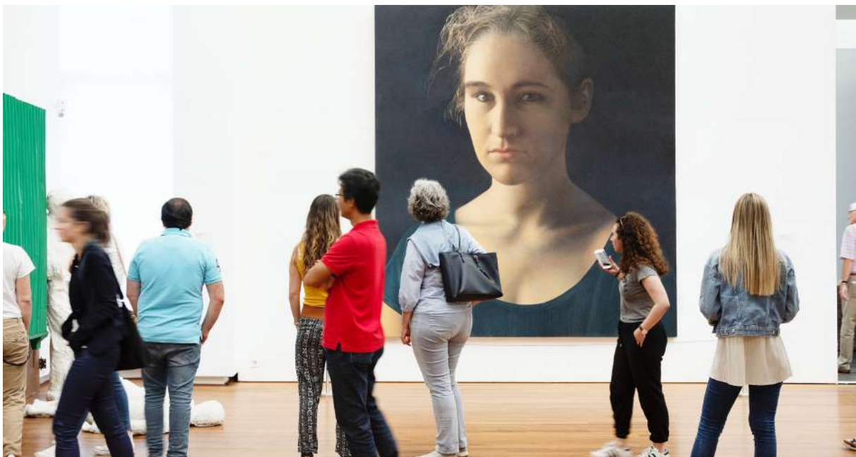
Kunsthaus Zürich, Collection „Contemporary Art“ with a work by Franz Gertsch.

On the other hand, the processes at the Kunsthaus had to be clearly defined. The interfaces of the individual systems (museum database MuseumPlus and ECM Archivemática) also need to be designed. For the archiving of a work several steps are necessary: the work has to be analyzed and, if necessary, discussed with the artist, the files have to be packed with the metadata and the documentation has to be added to the museum database. With the introduction of iCAS FS as a digital long-term archive, the awareness of internal processes at the Kunsthaus Zürich has developed enormously. IT and the conservation department agree: "The changeover to iCAS FS helped us enormously in optimizing our processes." This is not least due to the flexibility of the solution.