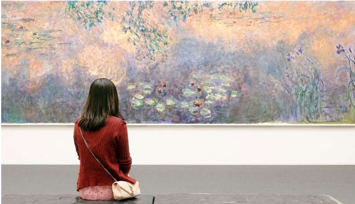
Kunsthaus Zürich, impressionism Works © Monet

The Kunsthaus Zürich (KHZ) faced this challenge. „With more than 700 video works, the Kunsthaus Zürich has the fourth largest video collection in Switzerland“, reports Kerstin Mürer, Head of Conservation at the Kunsthaus. With the extension building, the Kunsthaus is to become Switzerland's largest art museum by 2020. This means in the same step: more born-digital works and more digitized works, which have to be saved and archived.